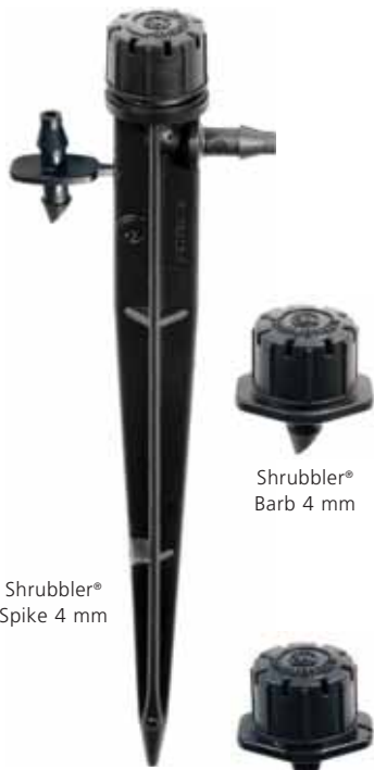
Shrubbler® Spike 4 mm