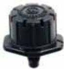
Shrubbler® Thread 4 mm