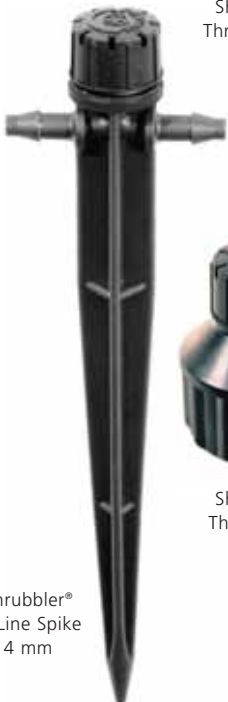
Shrubbler® In-Line Spike 4 mm