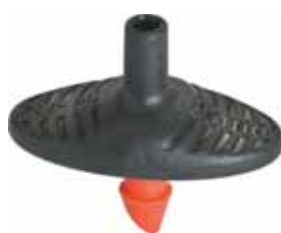
Pinch Drip™ PC 2 lph Barb 4 mm