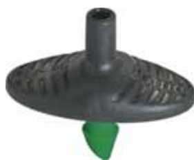
Pinch Drip™ PC 8 lph Barb 4 mm