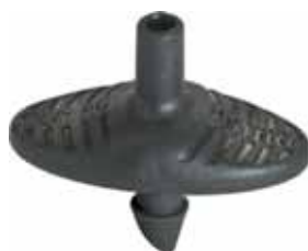
Pinch Drip™ PC 4 lph Barb 4 mm

* C v for all Pinch Drip™ emitters conforms to ISO 9261